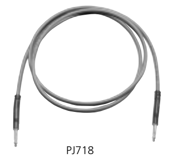
Three-Conductor Single Patch Cord