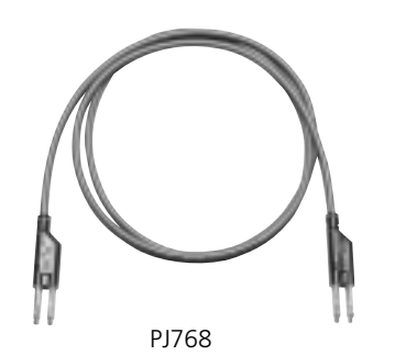
Three-Conductor Dual Patch Cord